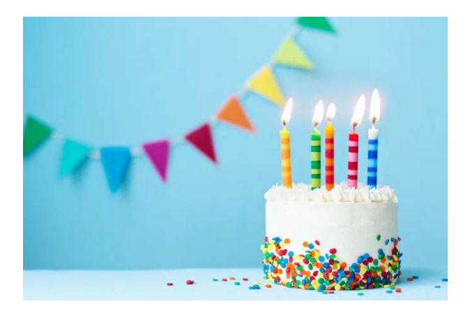
Staff Birthday Treats

Each month, the PSO arranges a special treat for the entire faculty & staff to celebrate the birthdays of all the staff members born in that particular month. If you would like to contribute to providing the monthly birthday celebration for the faculty and staff, please contact PSO Faculty Appreciation for details and further information.